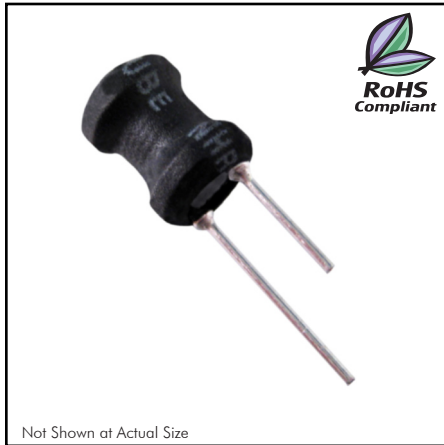
Not Shown at Actual Size

From 3.9 \mu\text{H} to 68,000 \mu\text{H}